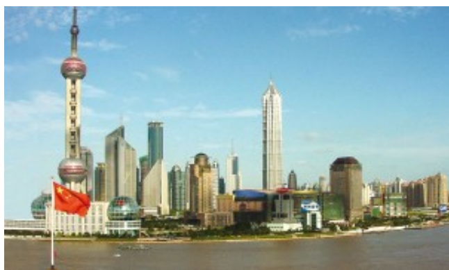
Day 8: Shanghai

Hotel check-out and included onward transfer to airport.