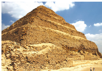
Overnight - Cairo (B)